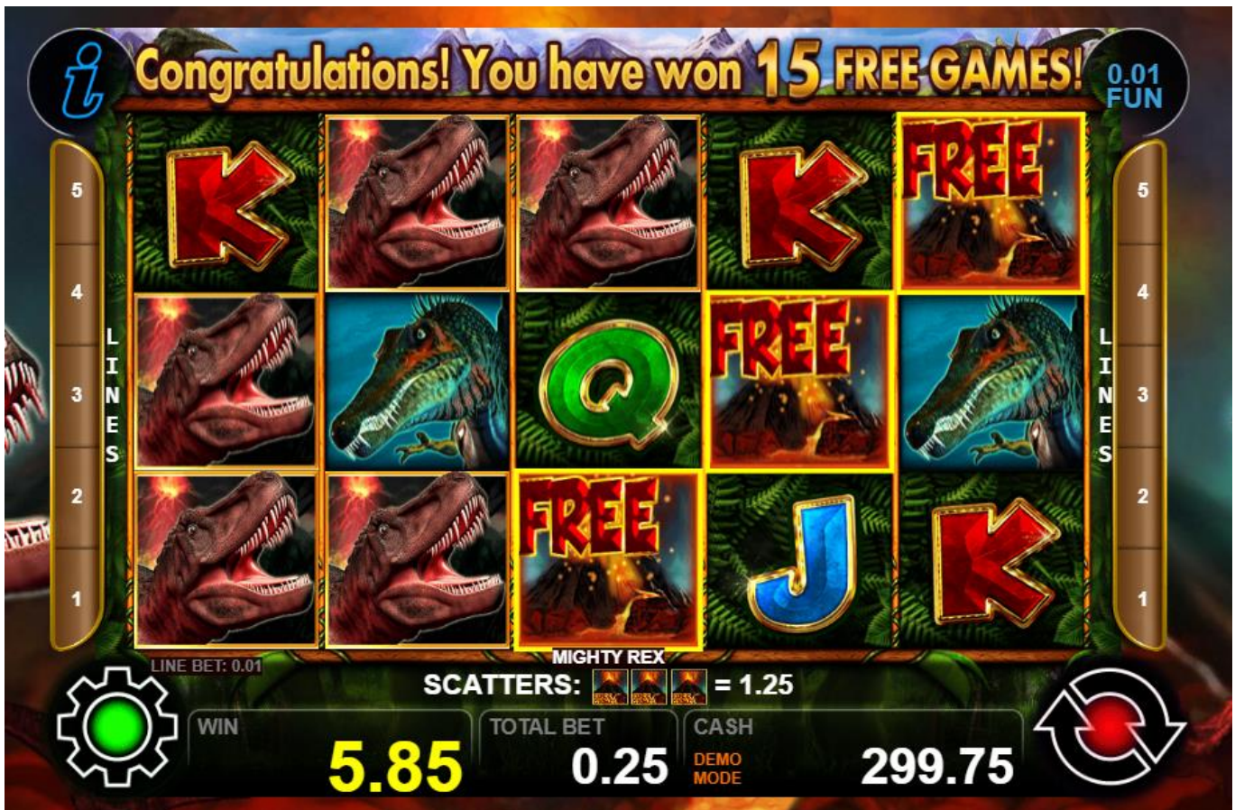
Fig.3 Free game screen