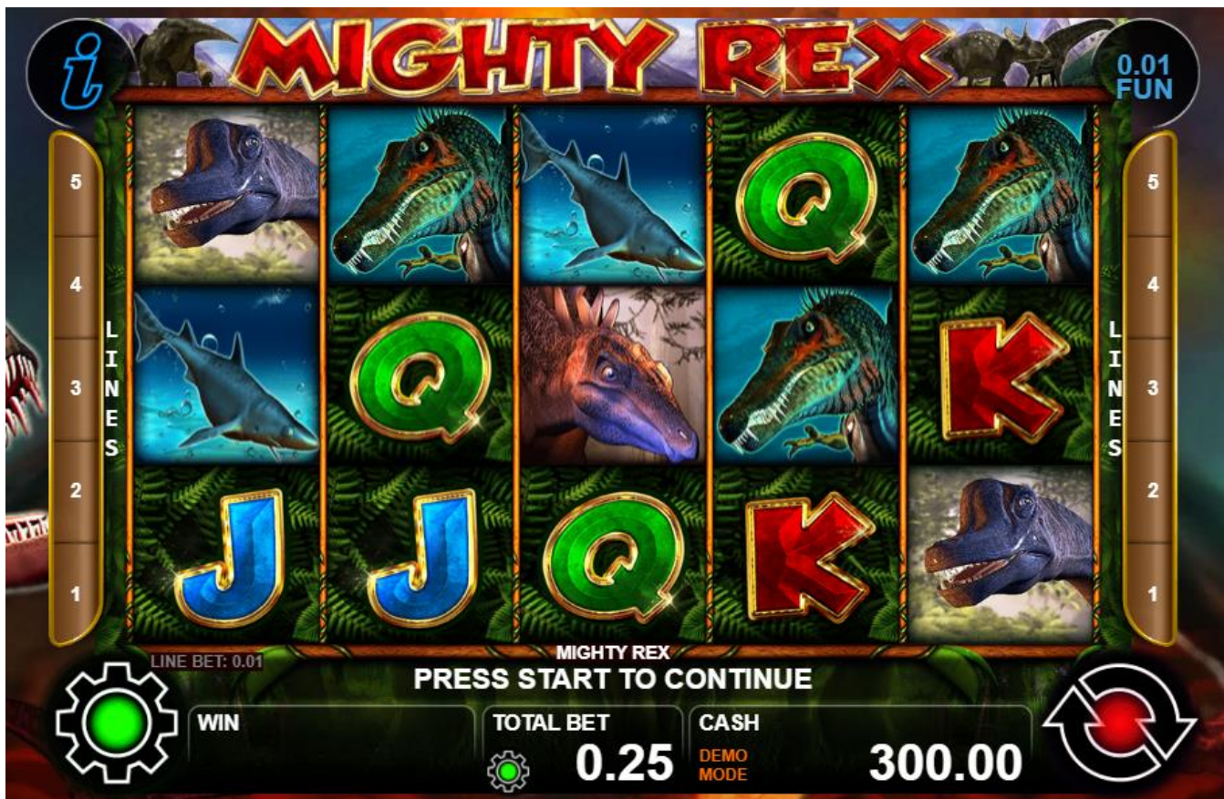
Fig.1 Main game screen