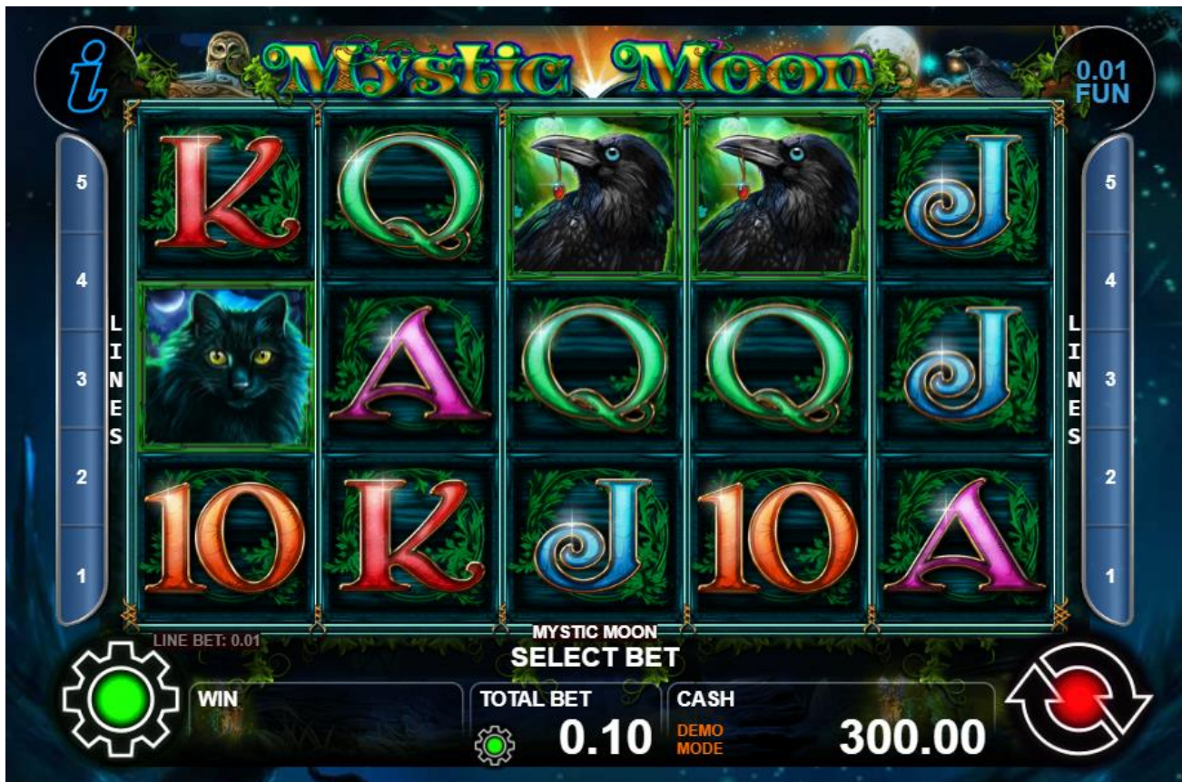
Fig.1 Main game screen