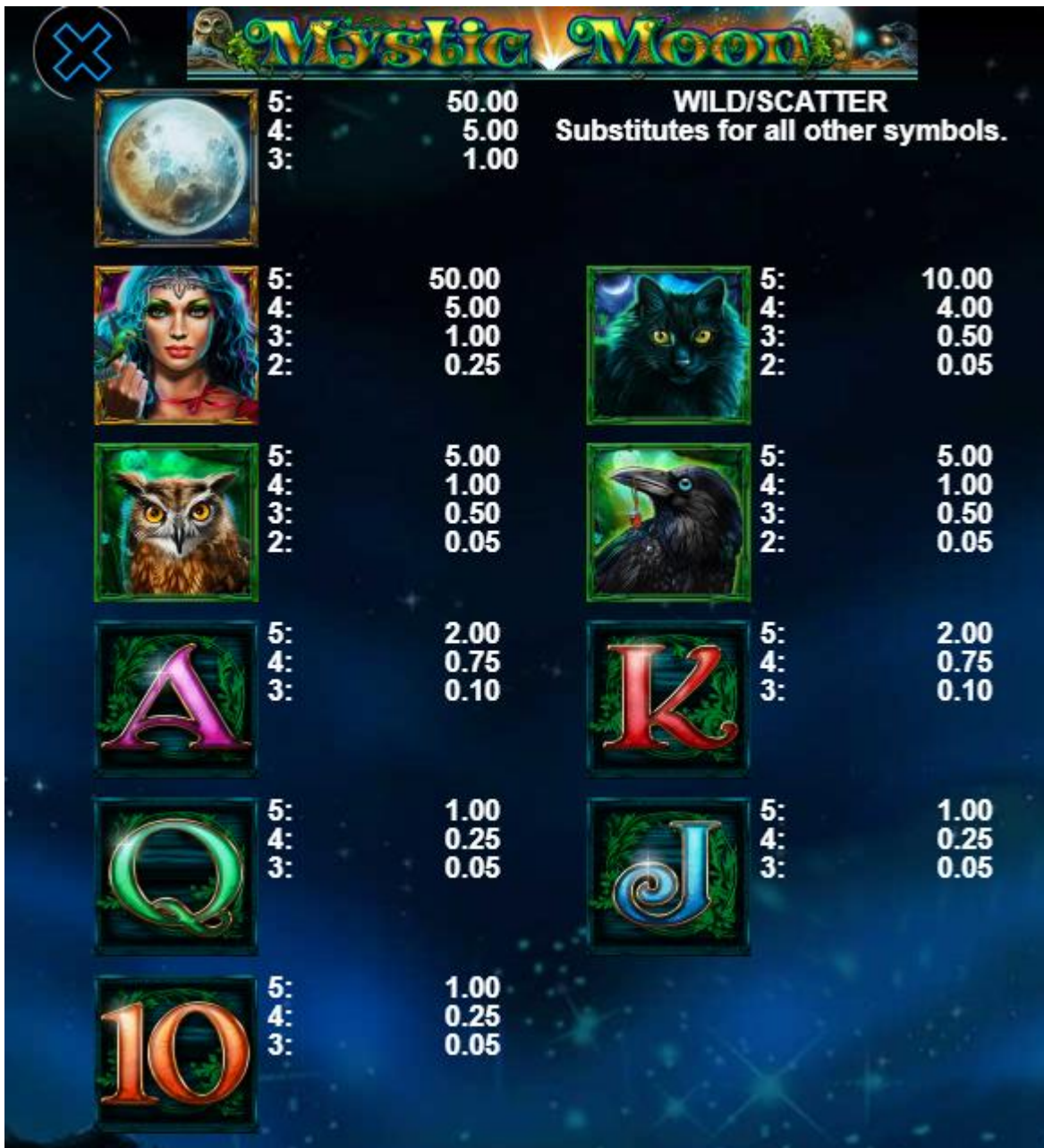
Fig.2 Pay table