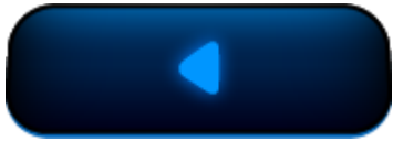
Page Back Button