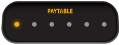
Current Page Info Display

Displays the title of the current info page and the location in info pages.